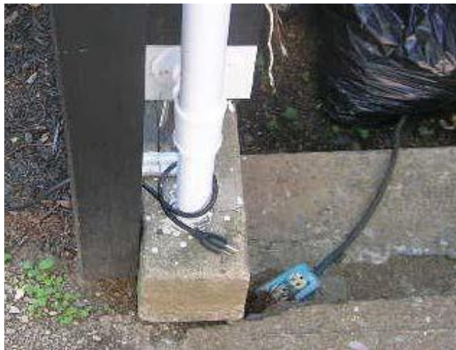
This image shows an outdoor wiring installation that is not a GFCI protected receptacle.

Facilities without GFCI receptacles installed in these specific locations should have this completed. For broader protection, consider GFCI circuit breakers to replace ordinary circuit breakers. For buildings protected by fuses, you are limited to receptacle-type GFCIs, and these should be installed in areas having the highest exposure to a water source such as kitchens, bathrooms and outdoor circuits. To further protect employees and volunteers from electric shock, GFCI protection should be provided when electric powered equipment is used. This would include items such as hedge trimmers, leaf blowers, lawn edgers, and hand-held power tools.